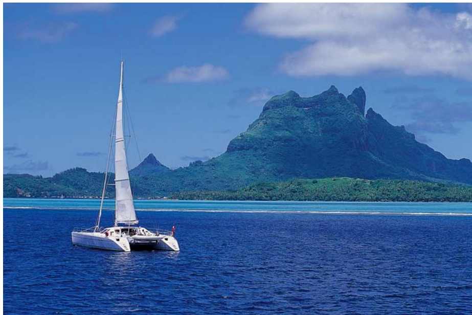
Making Landfall on Bora Bora